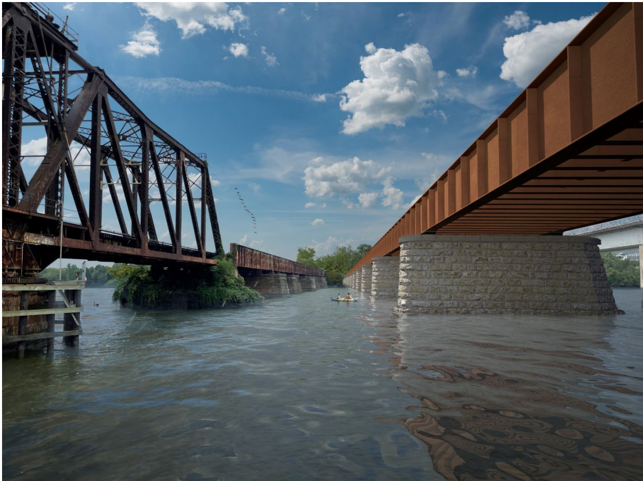
Rendering of the proposed rail bridge over the Potomac River.

225 NORTH SHORE DRIVE, PITTSBURGH, PA 15212-0774 • TEL 412.807.2000