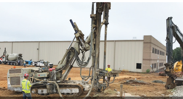
Grouting - Freshpet Innovation Center, Bethlehem, Pa.

General Construction | Heavy Civil | Geotechnical