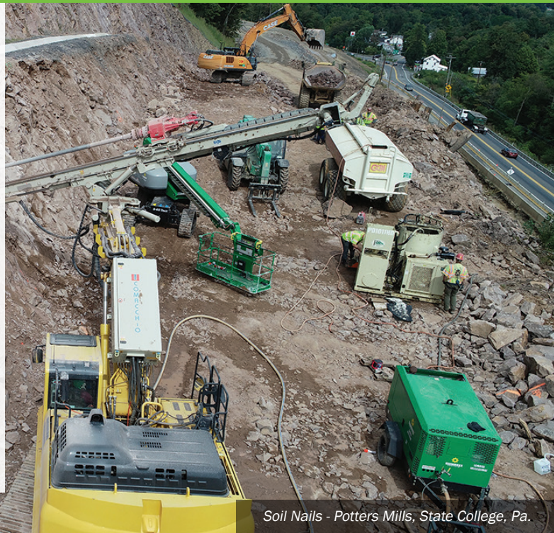
Soil Nails - Potters Mills, State College, Pa.

Auger Cast Piling Braced Support Cofferdams Drilled Shafts & Caissons Low Mobility Grouting Micropiles & Micropile Walls Pile & Lagging Walls Pile Driving Sheet Pile Bulkheads Sheet Piling Soil Nail Walls Tieback Walls Tiedown Anchors Underpinning